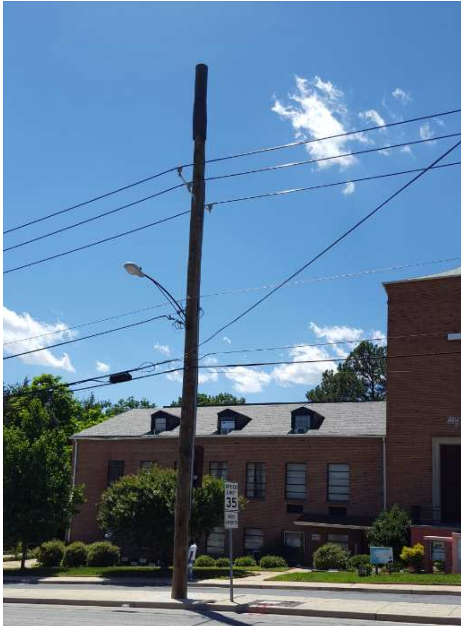
Figure 2: Photo of Small Cell Siting with 9.8 Cubic Feet of Equipment

16. In my experience, while there may be a potential business justification for some industry participants to seek to place larger devices—for example, to serve a large number of carriers -- the industry has generally been able to address its needs with small cell equipment of up to 12 cubic feet and, in most cases, significantly less. Anything larger than 12 cubic feet is