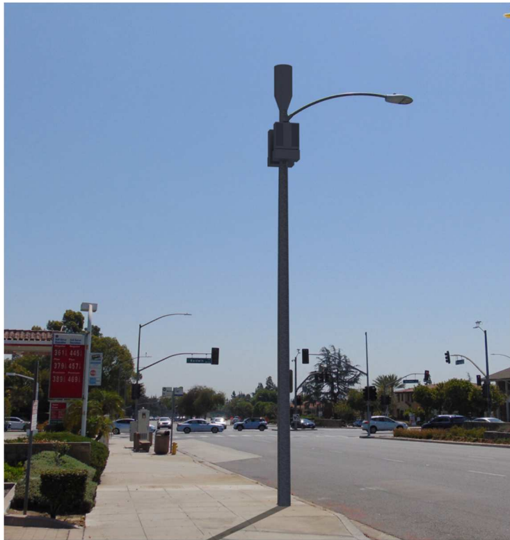
Figure 1: Example Single-Carrier Small Cell on Utility Pole – 2.3 Cubic Foot Antenna and 3.4 Cubic Feet of Equipment